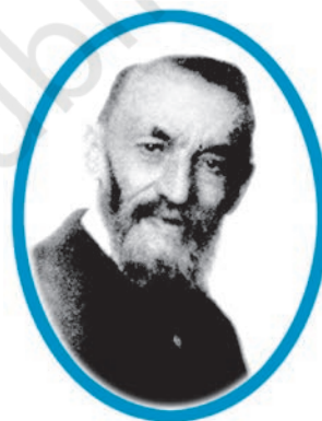
G. Peano (1858-1932)