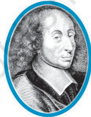
Blaise Pascal (1623-1662)

In earlier classes, we have learnt how to find the squares and cubes of binomials like a + b and a - b . Using them, we could evaluate the numerical values of numbers like (98)^2 = (100 - 2)^2 , (999)^3 = (1000 - 1)^3 , etc. However, for higher powers like (98)^5 , (101)^6 , etc., the calculations become difficult by using repeated multiplication. This difficulty was overcome by a theorem known as binomial theorem. It gives an easier way to expand (a + b)^n , where n is an integer or a rational number. In this Chapter, we study binomial theorem for positive integral indices only.